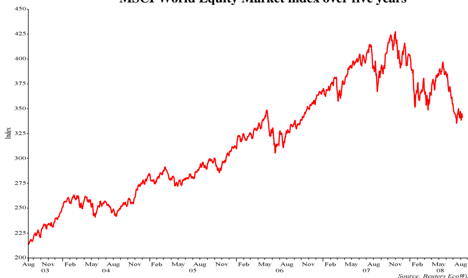
MSCI World Equity Market index over five years

The MSCI World Equity Market index has provided a total return of +2.54% in sterling over the last six months and -2.21% over the last year.